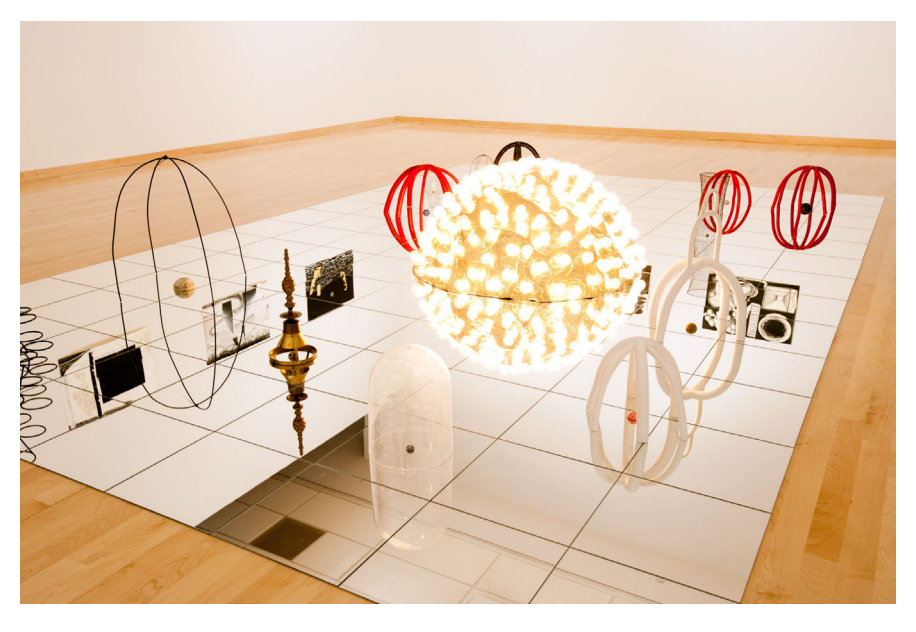
Erica Prince, Released From Orbit , 2012. Mirror, glazed ceramic, wire, found objects, plaster, paper maché, spray painted aluminum foil and lights, 487.68 cm x 609.6 cm x 22 cm.

Echoing my early lyrical misinterpretation is conceptual poet and recently (rightly) criticized "Uncreative Writing" champion, Kenneth Goldsmith, who lists an expansive 800 confused lyrics in Head Citations (The Figures, 2002). Some of my favourites include: Joy to the viscous and the deep-blue sea, Mustang salad, Goodbye groovy toothpaste, Traveled the world in generic jeans, Count the head-lice on the highway, Gimme the Beach Boys and free my soul, and Killing me softly with his saw. These are funny and relatable, as it's not uncommon to misunderstand lyrics. But there is something else at work in the mechanics of such misinterpretations: often, even when we've amended our flawed understanding, the original